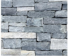
IRISH GRAY - Ledgerstone