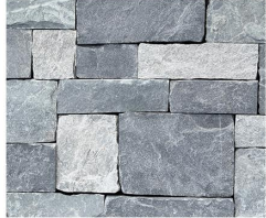
IRISH GRAY - Square-Rec