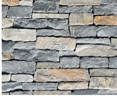
FIELDSTONE BLEND - Ledgerstone