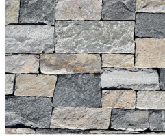
FIELDSTONE BLEND - Ashlar