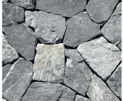
IRISH GRAY - Mosaic