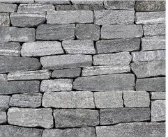
STERLING GRAY - Ledgerstone