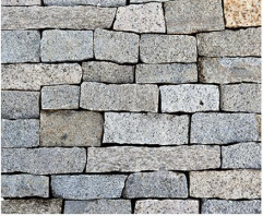
MILFORD GRANITE - Ledgerstone