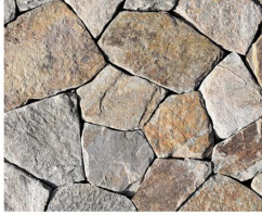
CONNECTICUT TAN - Mosaic