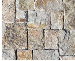
CONNECTICUT TAN - Square-Rec