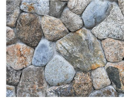
FIELDSTONE BLEND - Round