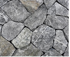
STERLING GRAY - Mosaic