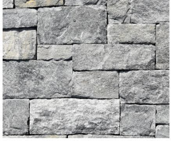
LINCOLN GRANITE - Ashlar