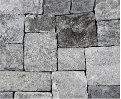
STERLING GRAY - Square-Rec