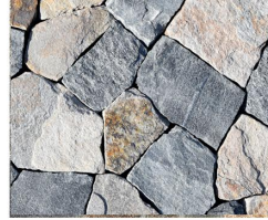
FIELDSTONE BLEND - Mosaic