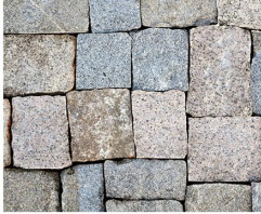
MILFORD GRANITE - Square-Rec