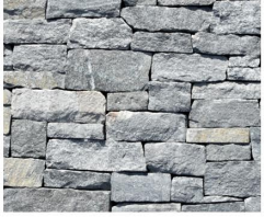
LINCOLN GRANITE - Ledgerstone