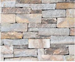
CONNECTICUT TAN - Ledgerstone