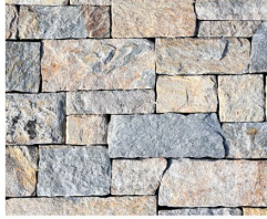
CONNECTICUT TAN - Ashlar