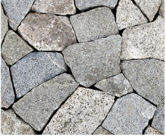
MILFORD GRANITE - Mosaic