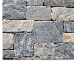
FIELDSTONE BLEND - Square - Rec