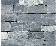
IRISH GRAY - Ashlar