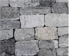
STERLING GRAY - Ashlar