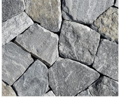
LINCOLN GRANITE - Mosaic