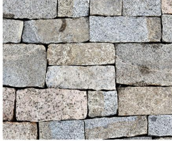
MILFORD GRANITE - Ashlar