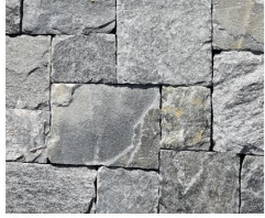
LINCOLN GRANITE - Square - Rec